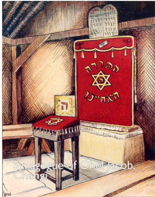
Synagogue of Ohel Jacob, Changi