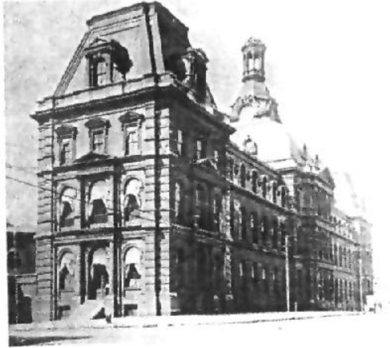
THE FOUR COURTS BUILDING

In all honesty, I consider the above information about Cyrus Ingerson Scofield trivial in comparison to the tampering he did with the word of God. The Lord gave more than one warning about doing that: